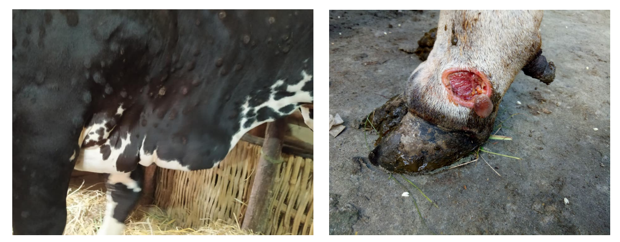
Figure 2. (left) Skin nodules up to 50mm are present on the neck and (right) Nodule scabs fall off leaving open wounds